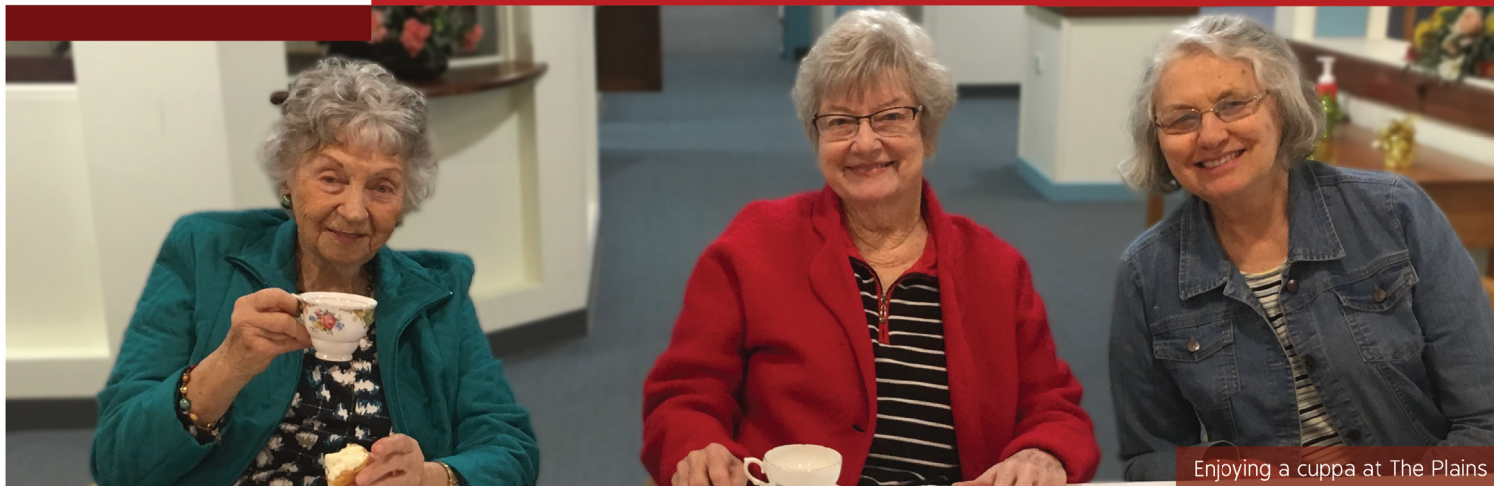
Enjoying a cuppa at The Plains